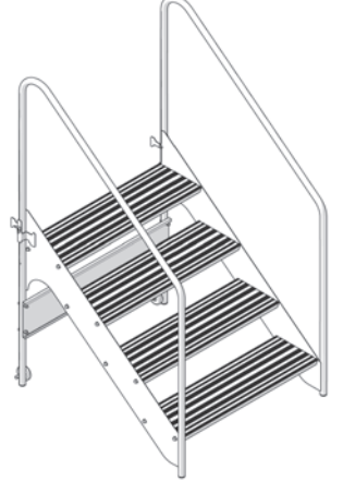
4-Step Fixed Height Stairway 281A102 For Stage Heights of 32" (813 mm) or 40" (1016 mm)