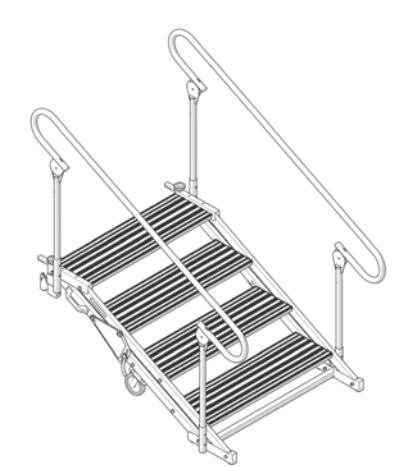
4-Step Adjustable Height Stairway 281A202 For Stage Heights from