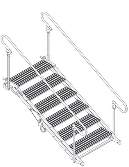
6-Step Adjustable Height Stairway 281A203 For Stage Heights from 24" to 48" (610 to 1219 mm)