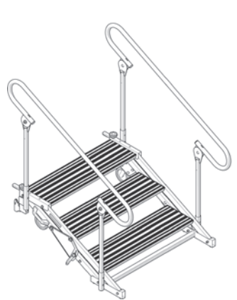
3-Step Adjustable Height Stairway 281A201 For Stage Heights from 12" to 24" (305 to 610 mm)