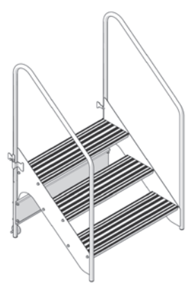
3-Step Fixed Height Stairway 281A101 For Stage Heights of 24" (610 mm) or 32" (813 mm)